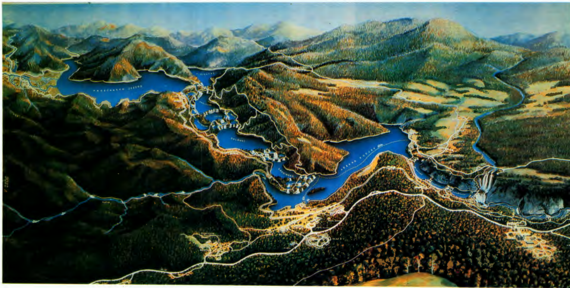
Panoramic drawing of the Plitvice Lakes - view from Medvedjak (Archives of advertising agency of the National park Plitvice). Panoramski crtež Plitvičkih jezera - pogled s Medveđaka (Arhiva propagandne službe Nacionalnog parka Plitvice).