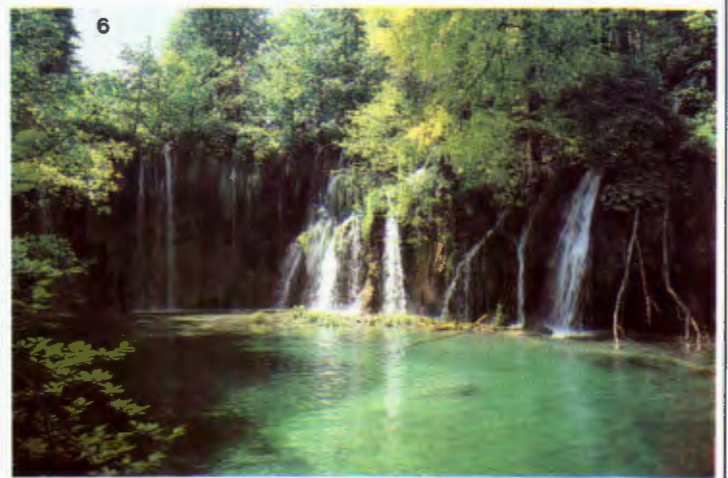
1. Sastavci- Donja jezera: part of travertine barrier. 2. Kozijak barrier. 3. Detail from travertine barrier. 4. Incrustation of dead tree sunk into the lake. 5. Waterfall Galovac. 6. Travertine barrier Batinovac between the lakes Okrugljak and Galovac.